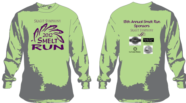
Lime Green Long Sleeve Tshirt